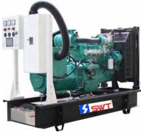
The picture only for reference