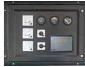
Control panel for soundproof

The DSE704 is an Automatic Mains Failure module with generator monitoring, protection and start facilities. It utilises advanced surface mount construction techniques to provide a compact yet highly specified module. This model can start the unit automatically when the MAINS failure and than control the ATS turn to the genset side. Operation of the module is via three pushbuttons mounted on the front panel with STOP, MANUAL and AUTO positions.