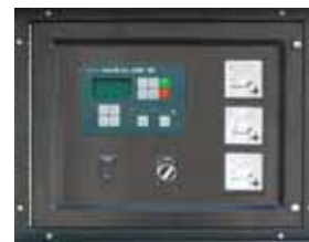
Control panel for soundproof

The AMF25 is an Automatic Mains Failure module with generator monitoring, protection and start facilities. The controller has a large LCD screen, display the generator's each parameter, running and alarm information. The off/replacement button, mode switch button , start/stop button and the LED indicator light, makes the user easy to operate and maintain the generator.