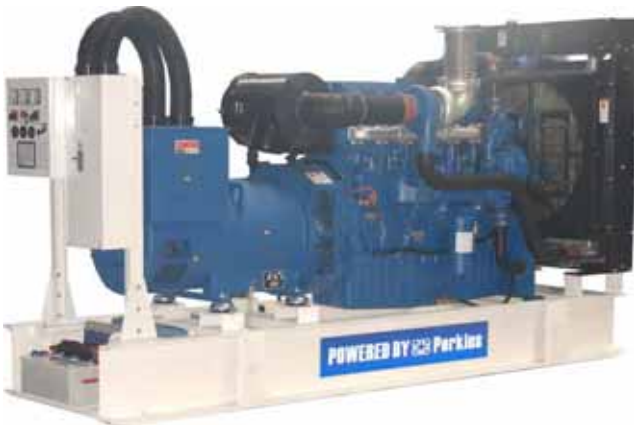
The picture only for reference