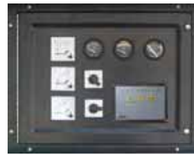
Control panel for soundproof

The DSE704 is an Automatic Mains Failure module with generator monitoring, protection and start facilities. It utilises advanced surface mount construction techniques to provide a compact yet highly specified module. This model can start the unit automatically when the MAINS failure and than control the ATS turn to the genset side. Operation of the module is via three pushbuttons mounted on the front panel with STOP, MANUAL and AUTO positions.