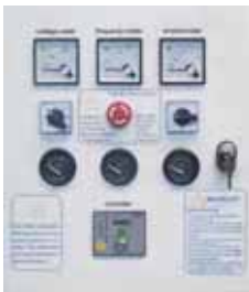
Control panel for open style

The Model 702 is a Manual Engine Control Module designed to control the engine via a key switch and pushbuttons on the front panel. The module is used to start and stop the engine and indicate fault conditions, automatically shutting down the engine and indicating the engine failure by LED, giving true, first up fault annunciation.